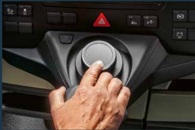
Innovative MAN SmartSelect multimedia controls

The additional room is put to good use in both trucks to integrate stowage space and compartments which make it easier to keep the cab tidy. These range from overhead compartments above the windscreen to various storage solutions in the central area or by the passenger seat.