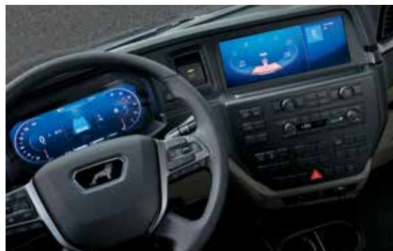
Infotainment system with 12-inch display and control system below the secondary display