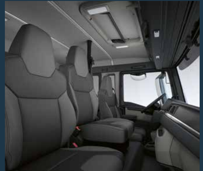
Second passenger seat for the MAN crew cab

Even the stair unit represents a step up: the wide, non-slip steps, optionally available with lighting, are designed for safety. The internal fittings have everything covered, too. The crew cab is not just a practical option, though: its elegant front is designed in the same style as the new MAN TG trucks. Aerodynamically optimised features minimise fuel consumption and improve cost-effectiveness.