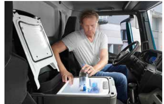
Perfect for independent types: on-board coolbox/fridge

The electric air conditioner works without a cold reservoir, which would have to be charged during vehicle operation, and is thus ready for use at any time. Even in summer it can keep things refreshingly cool for up to 11 hours. While the truck is on the road, MAN Climatronic maintains the chosen temperature fully automatically. Comfortable temperature zones in the cab are assured as well, as the foot area and