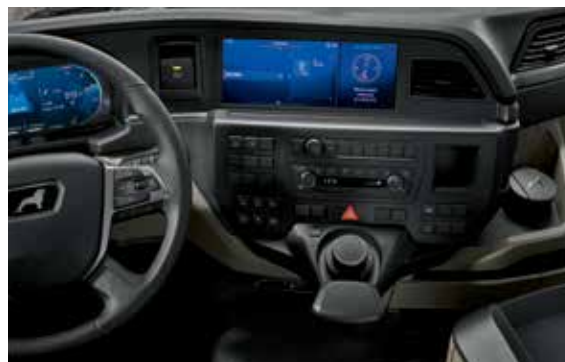
Infotainment system with 12-inch display and MAN SmartSelect

The infotainment system can be operated either via a classic control system with buttons or via MAN SmartSelect (can be combined from version Advanced 7 inch). Throughout, familiar usage meets innovative comfort. The result is one you can see and feel, too, as high-quality surfaces make every journey with the new MAN TGM and TGL tangibly special.