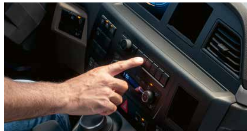
Freely programmable direct access buttons fitted with touch sensors

Theory times experience: the controls for the new MAN TGM and TGL are the result of combining the latest scientific analyses with insights from intensive on-road tests with drivers.