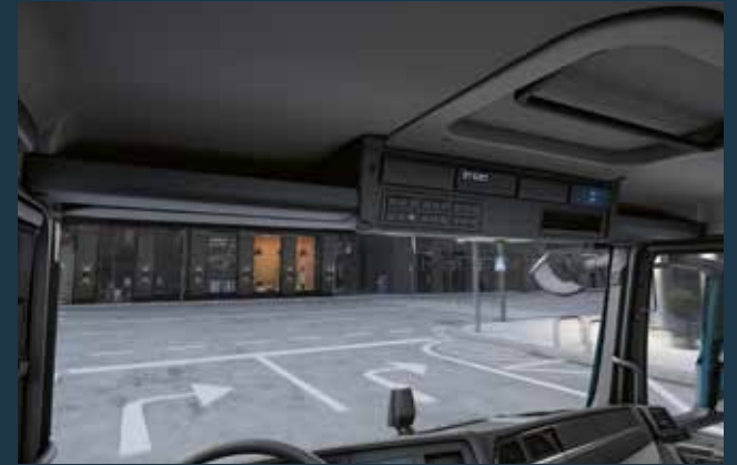
The two spacious storage compartments above the windscreen are ideal for items which need to be easily accessible.

One feature is even an absolute first: the trailblazing MAN SmartSelect system, which was developed together with our customers, makes using the multimedia system child's play even in demanding driving situations. Here, too, comfort was our inspiration for eliminating the touchscreen. With MAN SmartSelect, functions such as maps, music, cameras and more can be selected via a user-friendly dial with hand rest. There's so much more to discover in our new driver's cabs, so get in, get comfortable and enjoy all the new possibilities.