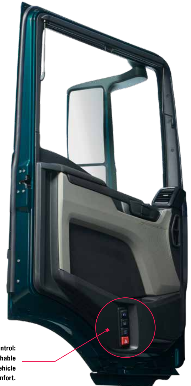
MAN EasyControl: four control buttons reachable from outside the vehicle for maximum comfort.

Even the steering wheel has been given greater flexibility: for the resting position, the steering wheel can be tilted forward to a horizontal position by the driver, and in action as well, it can be given as steep an angle as that of an average passenger car. The result is a workplace that bends over not only backwards, but forwards and sideways as well, to suit. So the driver doesn't have to.