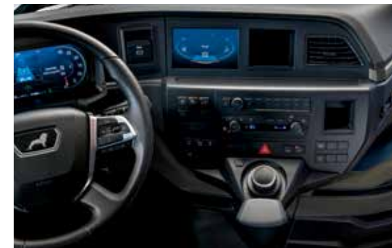
Infotainment system with 7-inch display and MAN SmartSelect